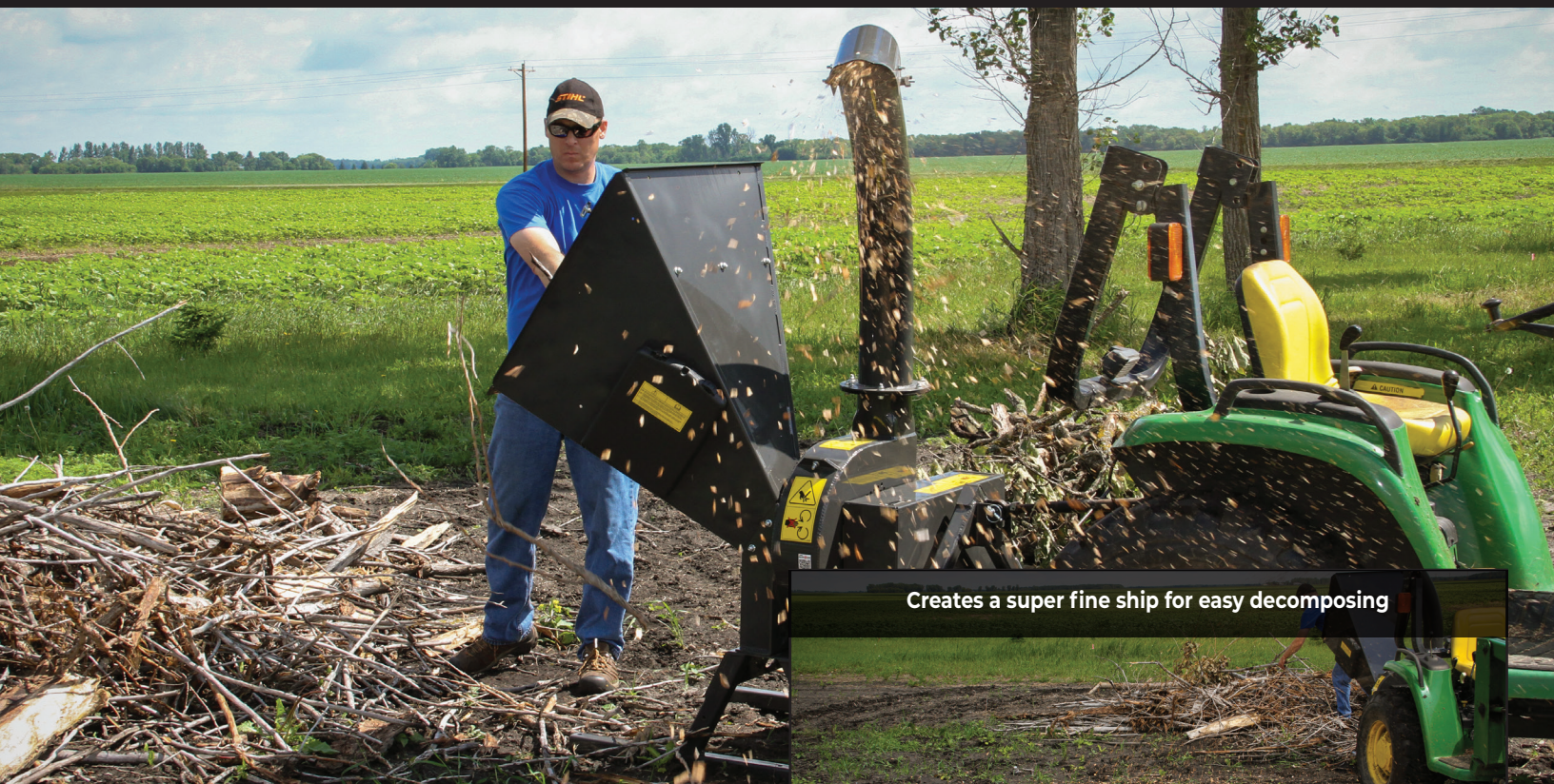
Creates a super fine chip for easy decomposing