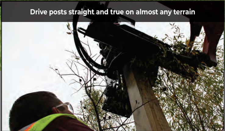
Drive posts straight and true on almost any terrain

This self contained post driver is THE ONE fencing contractors, landscapers, ranchers, and municipal developers choose.