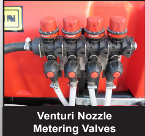
Venturi Nozzle Metering Valves