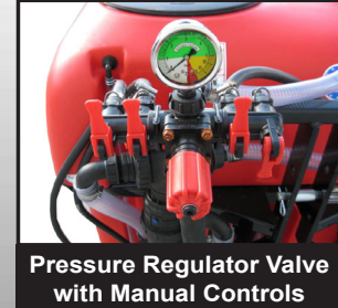
Pressure Regulator Valve with Manual Controls