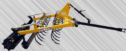
AV3 with optional Pull-Type Hitch, AV3-4 & AV3-5

Optional Equipment: Scarifier Shank Kit, Gauge Wheels, Pull-Type Hitch