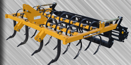
AV3 with optional Scarifier Shanks