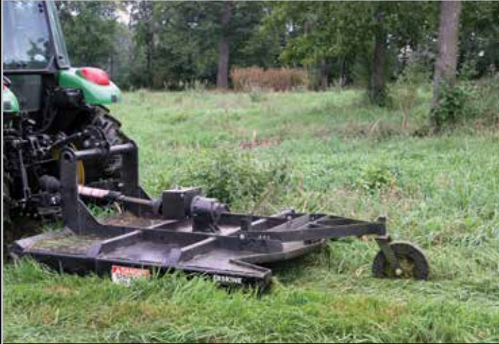
Open deck design allows easy access to brush and trees.