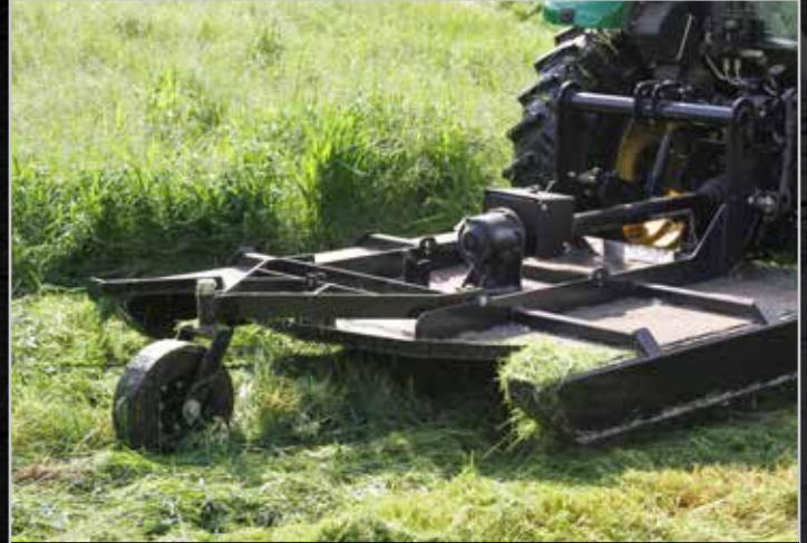
Tail wheel is easily adjustable for height and can be secured in an upright position when not needed.