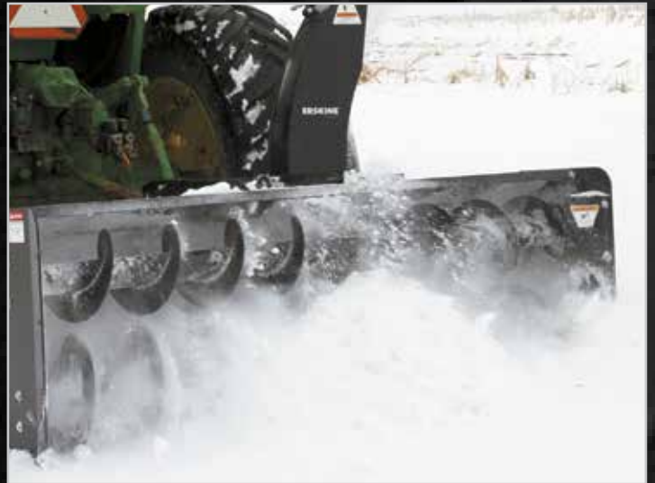
Large open-flight auger with shear bolt protection