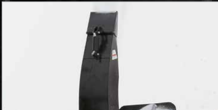
No freeze-up-chute design seals out snow and freezing slush