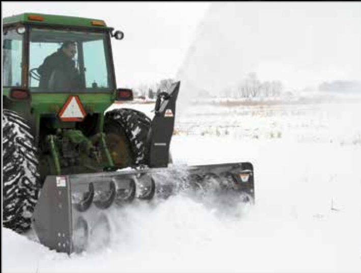
Standard hydraulic orbit motor chute rotator