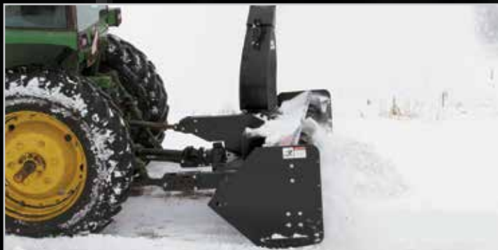
Adjustable and Replaceable Skid Shoes