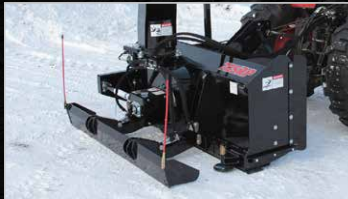
Optional Rear Blade.