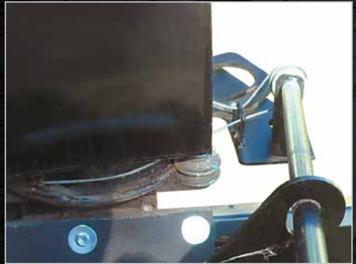
Hand crank chute rotation standard.