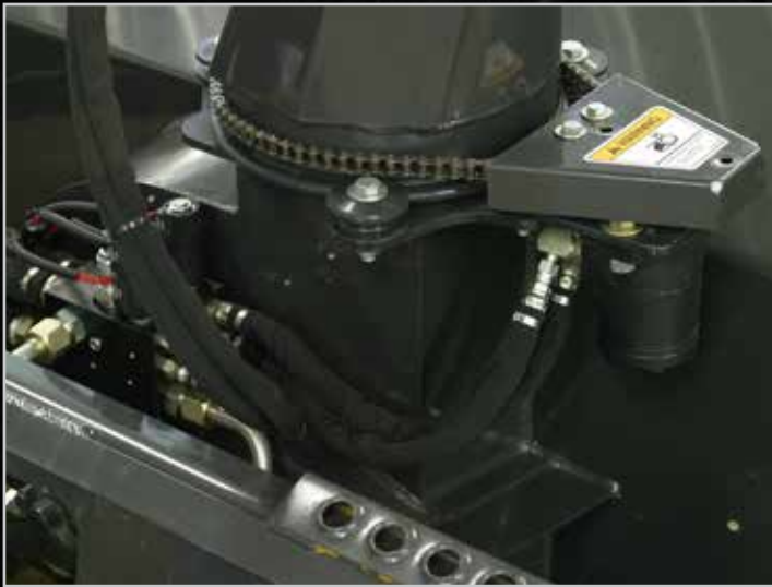
Optional hydraulic chute rotation for ease of operation – ideal for tractors with cabs.