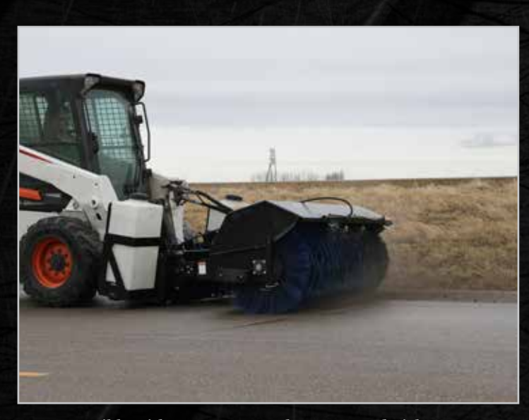
Compatible with our Power Angle Broom and Pick-Up Broom, as well as most third party broom attachments.