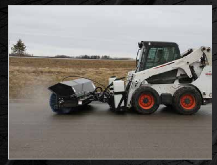
Spraying time approximately 40 minutes between fills.