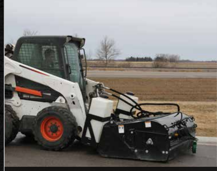
12V pump operates from standard power source