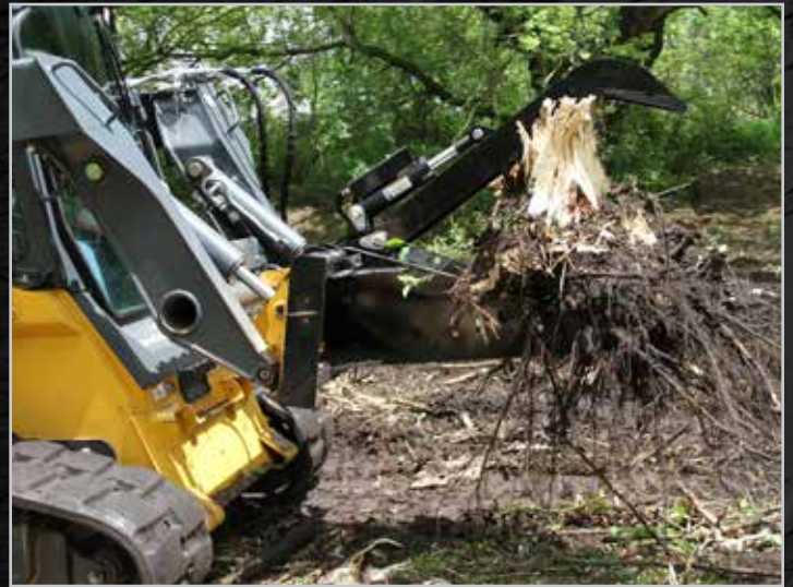
9.1" Wide grapple opening and greasable hinge points.