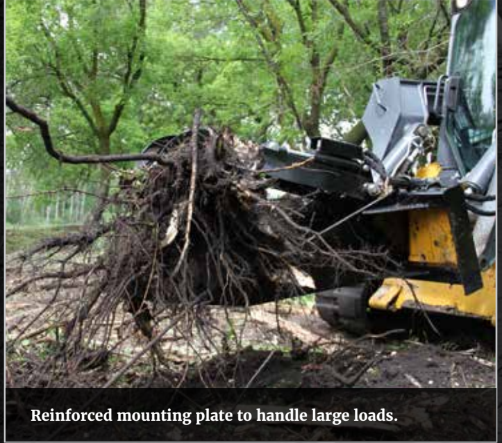
Reinforced mounting plate to handle large loads.