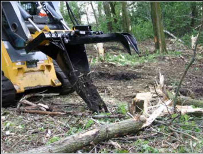
Fulcrum point for added leverage while prying.