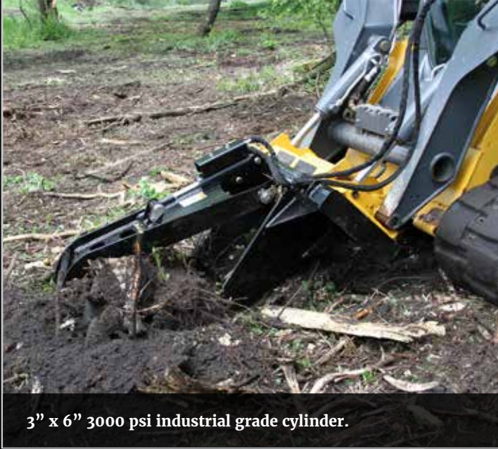
3" x 6" 3000 psi industrial grade cylinder.