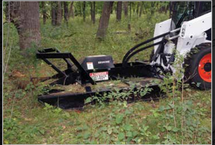
Heavy-duty deck helps push down trees and brush.