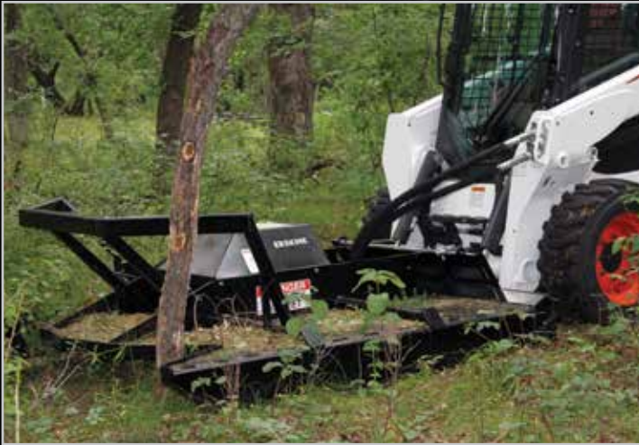
Topple small trees while breaking new trails.