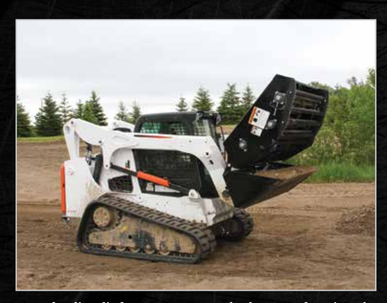
Hydraulic cylinder opens top cover for fast, easy dumping of the large containment bucket.