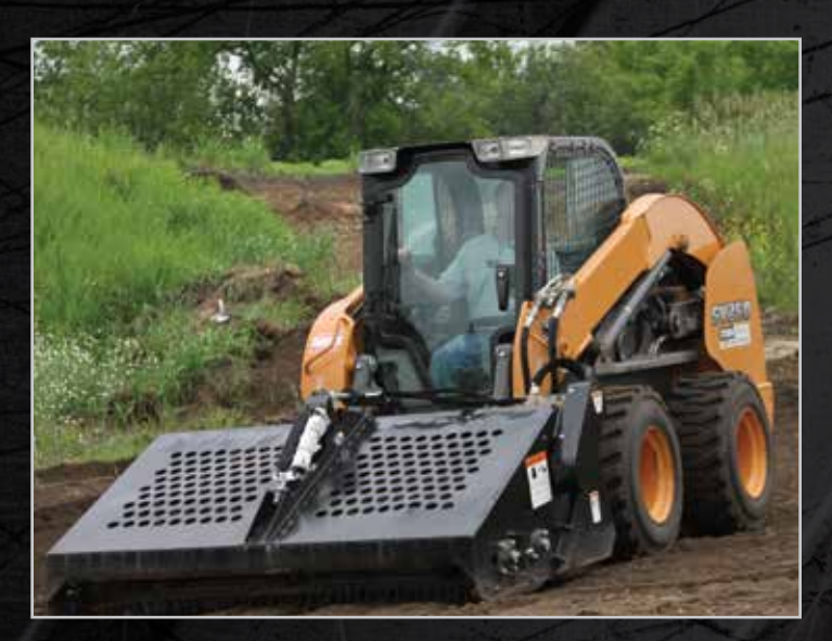
The Landscape Rake was designed to remove small to medium-sized rock as small as 3/4" along with unwanted roots and debris.