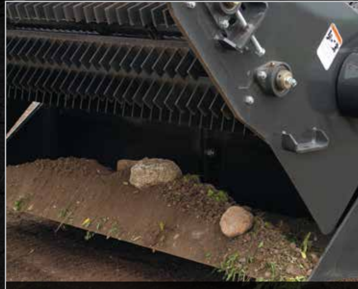
12 reversible bolt-on rake bars manufactured from 7 gauge steel.