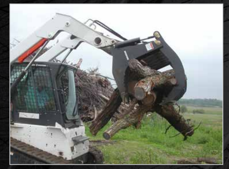
Unique serrated edges provide grip to prevent items from rolling out