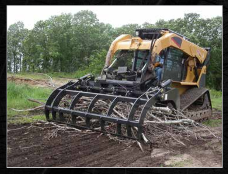
Top teeth 1/2" thick T1 steel