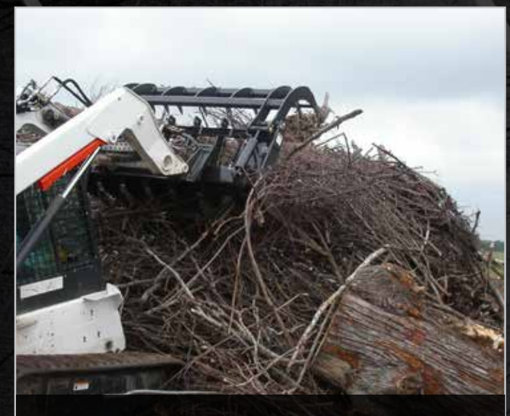
Optimal spacing allows unwanted debris to fall through