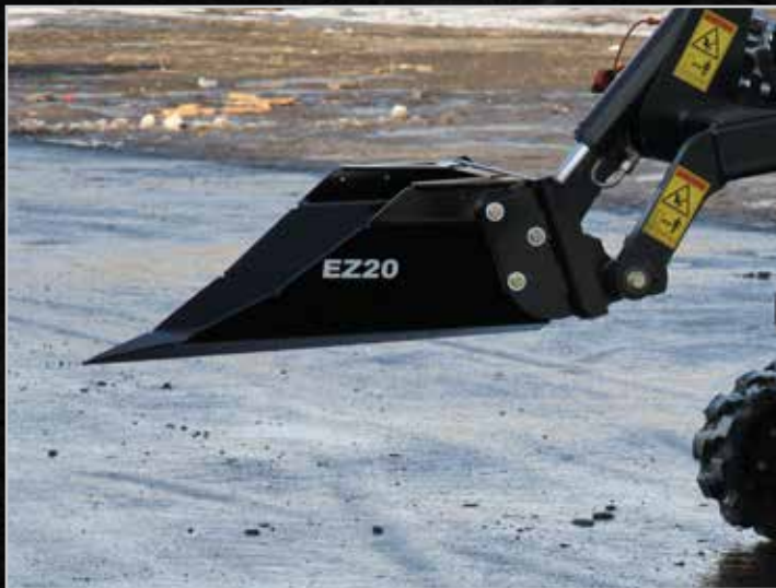
The sharp digging point allows easy ground entry.