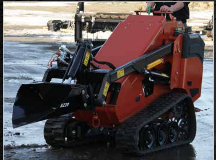
Made with 1/4" high alloy steel and a reinforced frame.