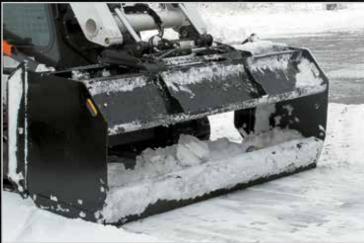
Optional "pull back" system.