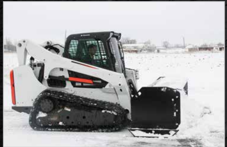
Extra thick 3/4" AR400 skid shoes are 2-position adjustable for depth control.