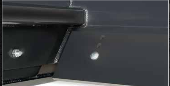
1/2" x 8" strong high-carbon steel cutting edge for long life