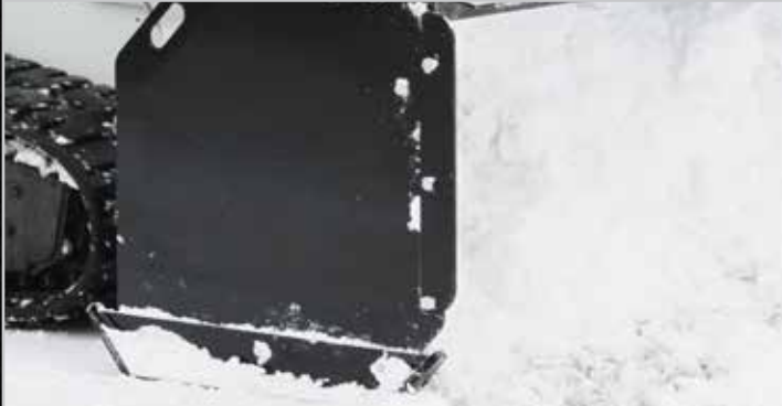
Adjustable height skid shoes