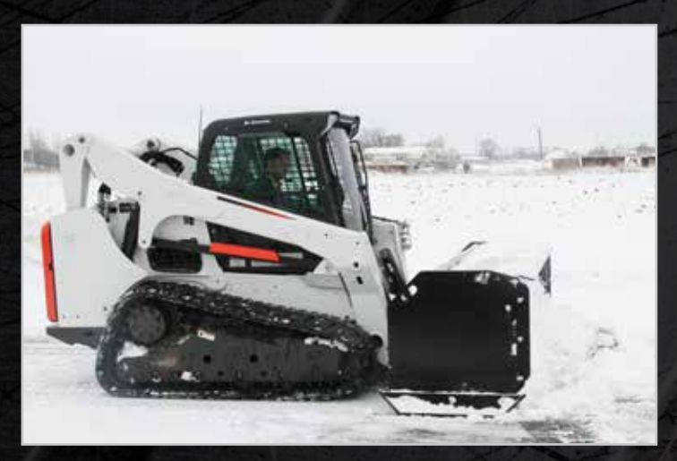
Extra thick 3/4" AR400 skid shoes are 2-position adjustable for depth control.