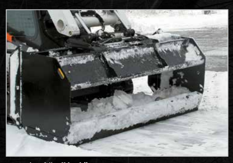
Optional "pull back" system.