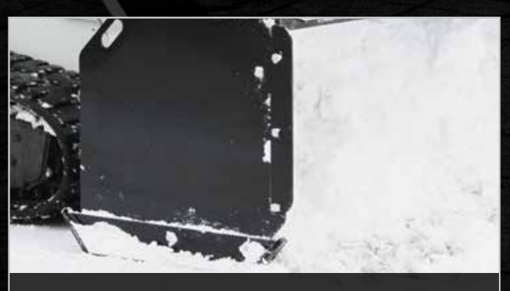
Adjustable height skid shoes