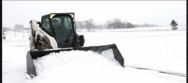
Open top for sight & high volume load capacity.