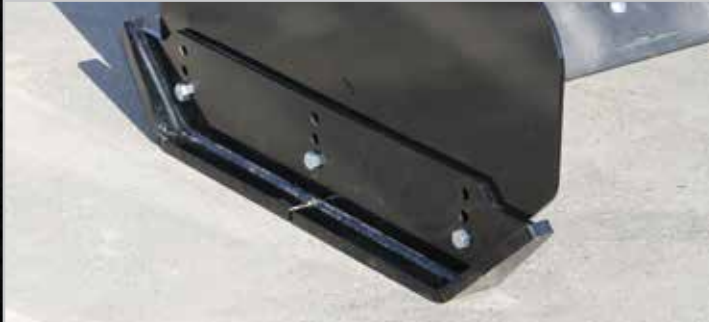
Adjustable AR400 skid shoes.