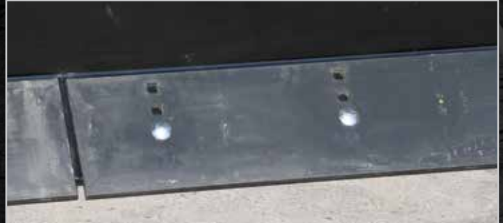
Adjustable cutting edge.