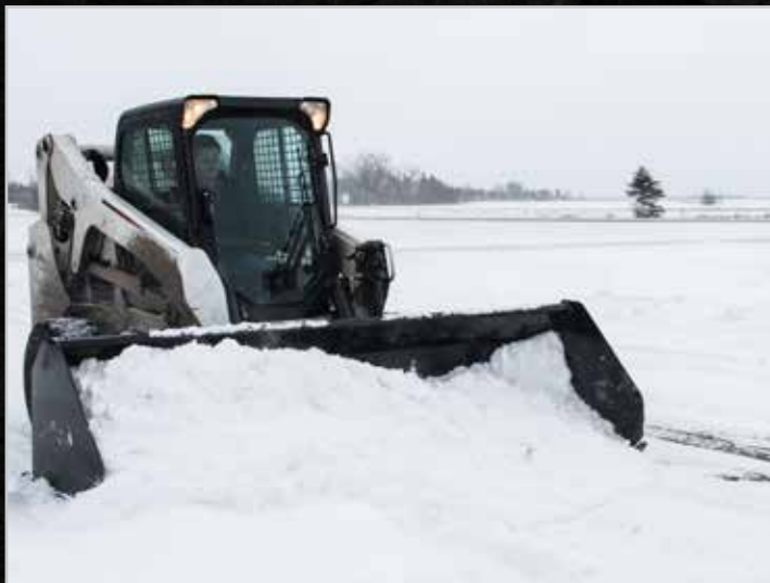
High volume design for optimal snow capacity.