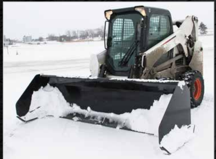
Moldboard curve allows for little snow build up.