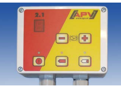
The 2.1 Controller is supplied with the ES 100 M1 Classic.

The ES 100 M1 Classic is ideal for spreading grass seeds, single cover crop seeds, granular micronutrients and slug pellets. The lightweight poly hopper has 3.53 cubic feet of capacity and provides long life, impervious to the environment. The spreading width and disc speed are directly controlled by the 2.1 Electric Controller from your tractor cab and the seeding rate is quickly set with an adjustable slide gate. With spread patterns up to 78 feet, depending on material, APV spreaders lead the industry in broadcast precision.