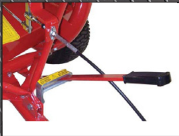
Gearbox lever to disengage drive for transport

PTB SERIES SPREADERS are a self contained, towable implement that can be operated by almost any vehicle. This unit has a ground driven, cast iron, oil bath gearbox that can be disengaged when transporting. It is ideal for spreading seed, fertilizer, sand, and salt. The large 20" diameter x 10" wide tires make this a "Turf Friendly" implement. The spreader features a cable control that allows the operator to adjust spread rate and turn the spreader on and off from the vehicle seat. This is a popular, low cost spreader for golf courses, parks, sports fields, and turf farms.