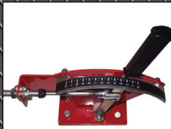
Remote cable control for calibration and shut off