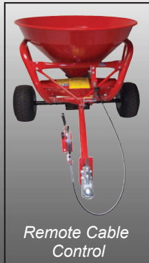
Remote Cable Control