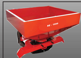
Shown with Optional 2 Row Band Attachment