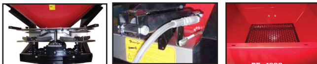
Twin Spinners & Gearboxes

Optional Equipment: Dual Banding Attachment