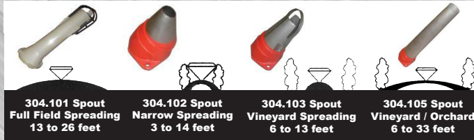
304.101 Spout Full Field Spreading 13 to 26 feet 304.102 Spout Narrow Spreading 3 to 14 feet 304.103 Spout Vineyard Spreading 6 to 13 feet 304.105 Spout Vineyard / Orchard 6 to 33 feet

Optional spouts for narrow row, wide row, & vineyard, orchard applications