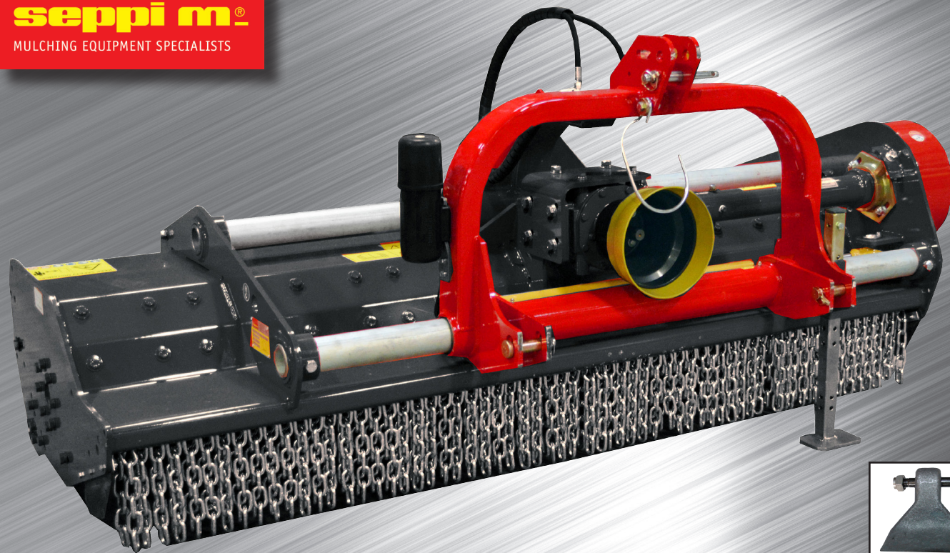
VARIABLE OFFSET HITCH • 60-100 HP