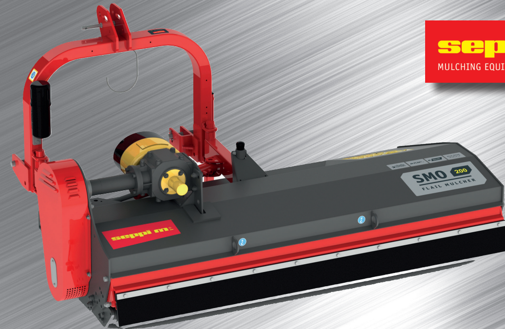
VARIABLE OFFSET HITCH • Up to 85 HP