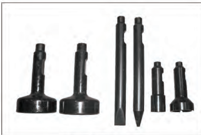
Post Driver Tools