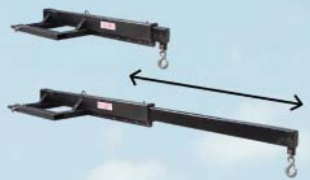
Manually adjusts from 6'9" to 12 feet with 9 different positions

Fits on most types of Forklifts Mounts to your Fork Tines