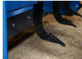
Standard With Rippers