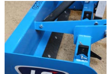
Heavy Duty Welded Design