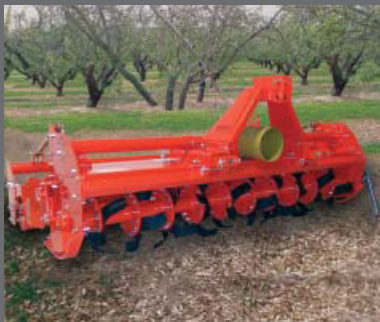
SPR Tiller with Adjustable Rear Roller