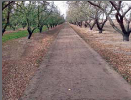
Cleaned, Tilled & Rolled Orchard Floor