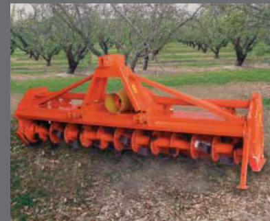
RG Tiller with Adjustable Rear Roller

An important application for these tillers with rear rollers is to bury wood chips by tilling 2 to 3 inches deep. The roller then slightly compacts and smooths out the orchard floor. The wood chips will decompose at a faster rate and the rolled out area is then in better condition for the harvesters. The University of California Cooperative extension recommends keeping wood chips and shavings in the orchards. They also stated that if well managed, prunings can become a source of organic matter and nutrients in the soil.