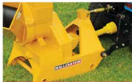
Shear Bolt Protected PTO Drive Train

Angling the log against the rotor requires less horsepower to chip, saving fuel.