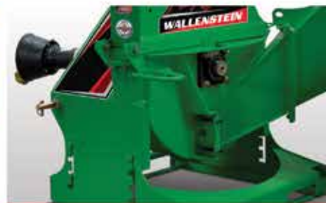
Adjustable Height Ski Base

The self-feed hopper pulls the branches in as it chips using the knife angle and gravity.