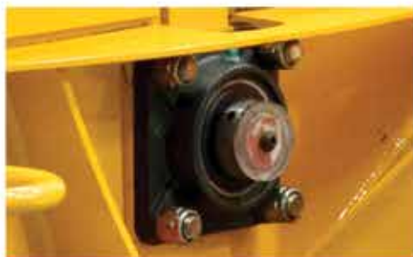
Bearing Plate Protection

BX Chippers are direct drive, no belts or pulleys. BXM models use belts and pulleys.