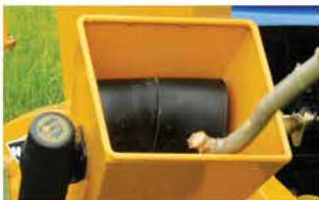
Self Feeding Chipper Hopper

Keeps wood chips from getting into the bearing and causing damage. (Excludes BXM Models)