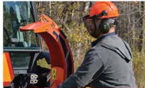
Adjustable Exit Chute