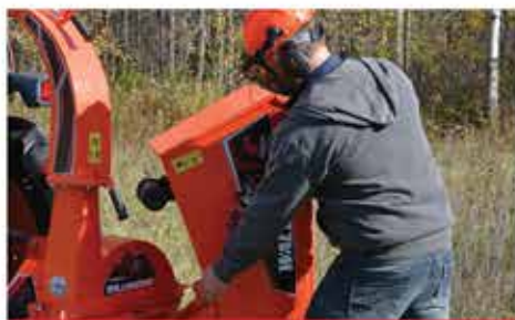
Fold Up Feed Hopper

Adjust to match your tractor's PTO height. (BX36S & BX52 Models)