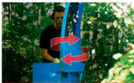
270° or 360° Exit Chute