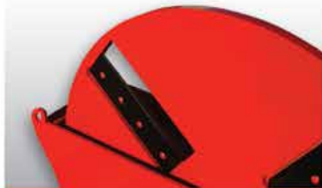
Oversized Heavy Duty Rotor