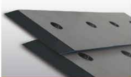
Hardened Reversible Knives